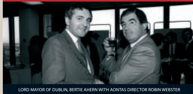
LORD MAYOR OF DUBLIN, BERTIE AHERN WITH AONTAS DIRECTOR ROBIN WEBSTER

Sony launches the first consumer compact disc player (CDP-101).