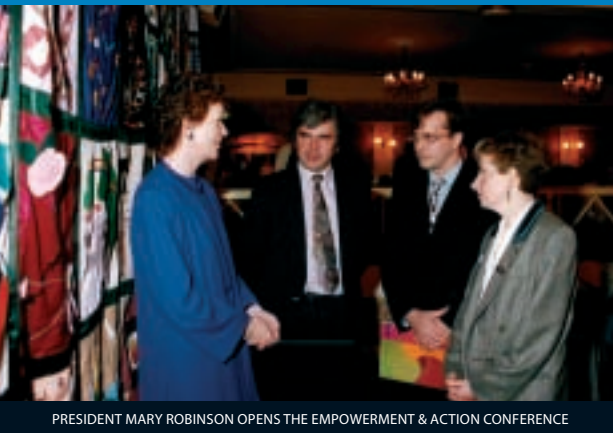
PRESIDENT MARY ROBINSON OPENS THE EMPOWERMENT & ACTION CONFERENCE

Dolly the sheep the first mammal, to be cloned is born in Scotland.