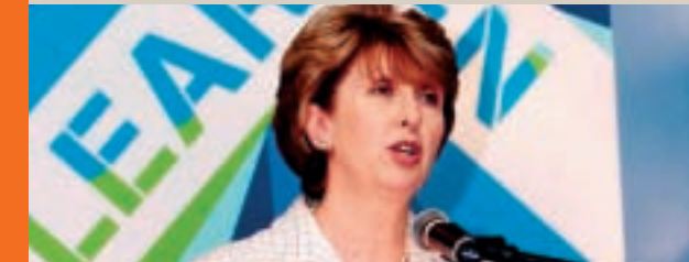
PRESIDENT MARY MCALEESE SPEAKING AT THE AONTAS ‘CITIZEN LEARNER’ CONFERENCE