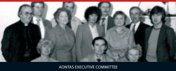
AONTAS EXECUTIVE COMMITTEE

John Lennon shot and killed by Mark David Chapman in front of the Dakota apartment building in New York City.