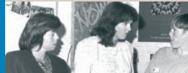
MINISTER OF STATE AT THE DEPARTMENT OF SOCIAL WELFARE, JOAN BURTON LAUNCHES THE AONTAS NOW PROJECT