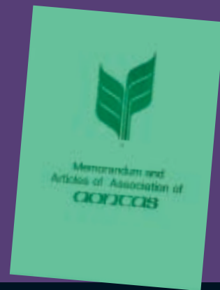
THE FIRST AONTAS CONSTITUTION

The Concorde makes its first supersonic flight at (700 mph/1 127 km/h).