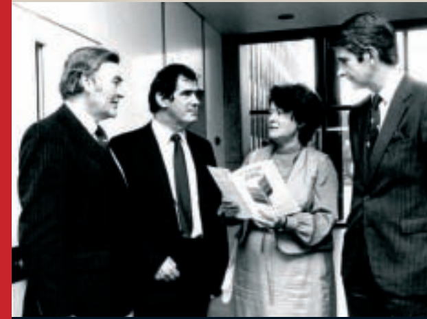
AONTAS DELEGATION MEETS MINISTER FOR EDUCATION GEMMA HUSSEY