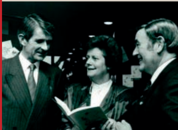
MINISTER FOR EDUCATION, MARY O'ROURKE LAUNCHES ADULT EDUCATION MONTH