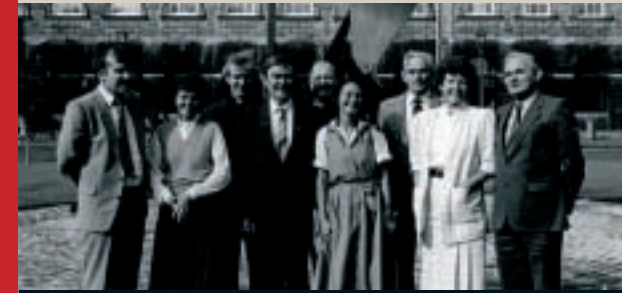
AONTAS EXECUTIVE COMMITTEE