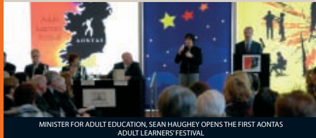
MINISTER FOR ADULT EDUCATION, SEAN HAUGHEY OPENS THE FIRST AONTAS ADULT LEARNERS FESTIVAL