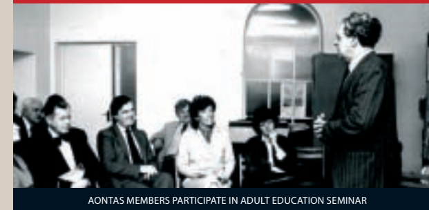
AONTAS MEMBERS PARTICIPATE IN ADULT EDUCATION SEMINAR

Do they know it's Christmas' is recorded to raise money for the famine in Ethiopia.