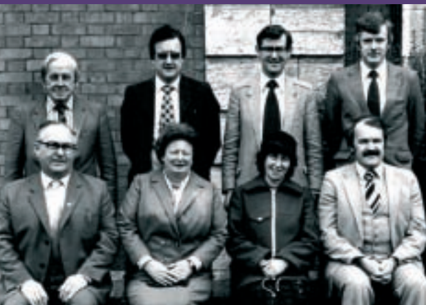
PARTICIPANTS AT THE AONTAS ANNUAL CONFERENCE

The first laser printer is introduced by IBM (IBM 3800).