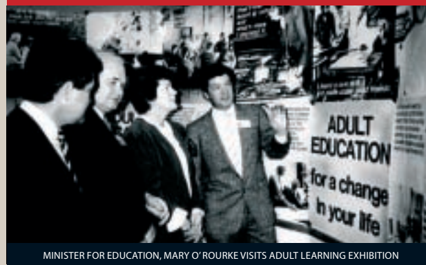
MINISTER FOR EDUCATION, MARY O'ROURKE VISITS ADULT LEARNING EXHIBITION

Benazir Bhutto is sworn in as Prime Minister of Pakistan, becoming the first woman to head the government of an Islam-dominated state.