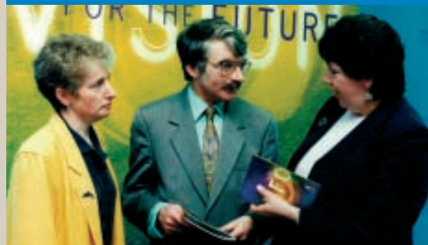
MINISTER WILLIE O'DEA LAUNCHES THE FIRST AONTAS STRATEGIC PLAN

Google, Inc. is founded in California by Stanford University Ph. D students.