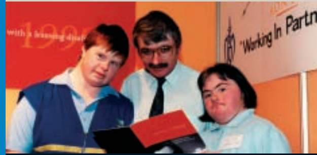
MINISTER WILLE O'DEA LAUNCHES 'COUNTING US IN'