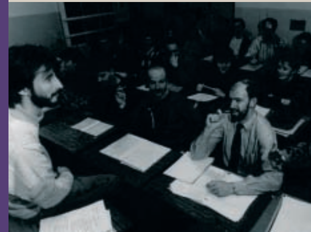
NEWLY APPOINTED AEOS GO BACK TO SCHOOL

Louise Brown the world's first test-tube baby is born in the UK.